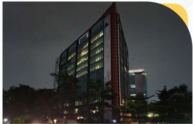
During Earth Hour @ WTC Annexe

Earth Hour across Brigade office spaces was more than just a symbolic switch-off—it was a collective step towards a more sustainable future.