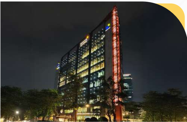
Before Earth Hour @ WTC Annexe